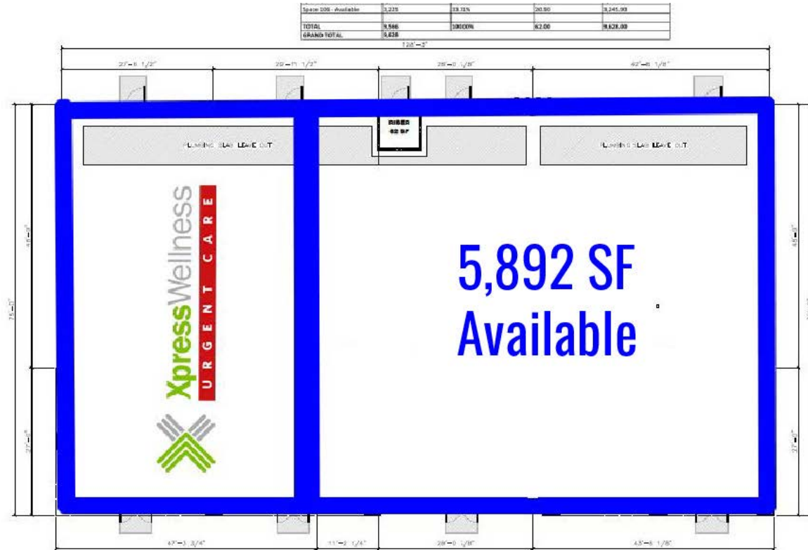
1 - FLOOR PLAN SCALE N/A